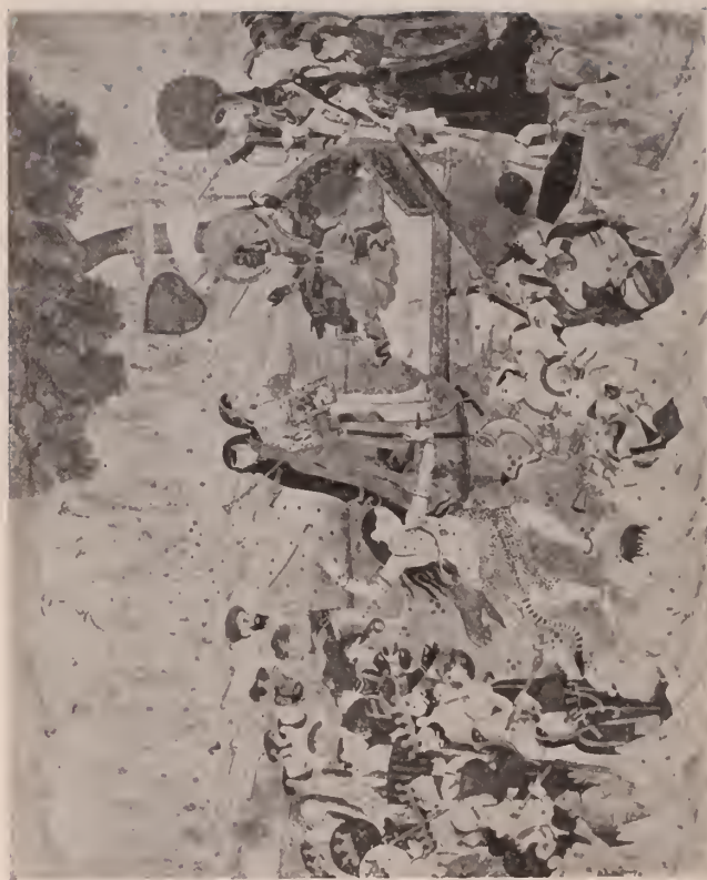
DANCE OF SHIVA (SADHYA GAYATRI), KANGRA KILM.